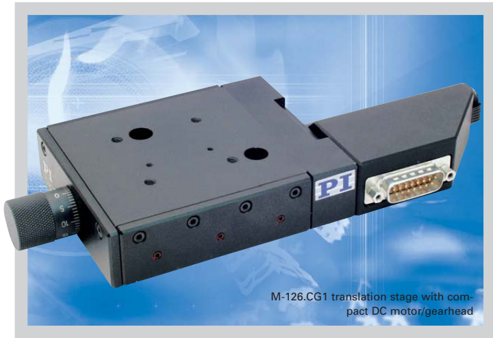
M-126.CG1 translation stage with compact DC motor/gearhead