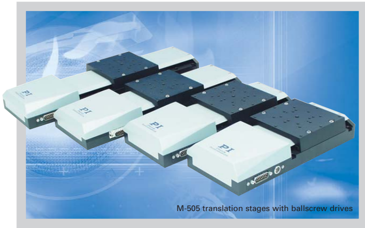
M-505 translation stages with ballscrew drives